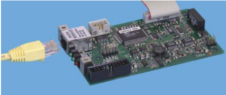
Card for inserting in power supply