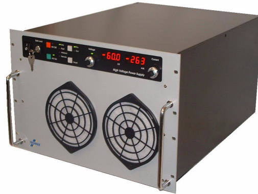
Non contractual photo