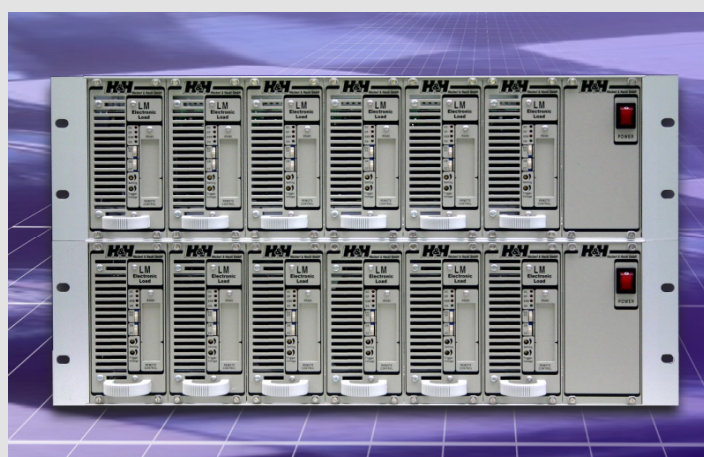
Load Modules in 19" Mainframe MF3-LM