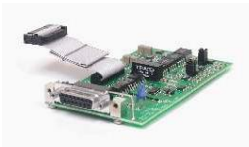
An ISO AMP CARD should be used in case of a non-floating programming source.